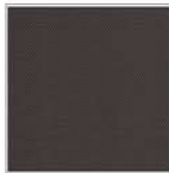
SunTex95 Dark Bronze